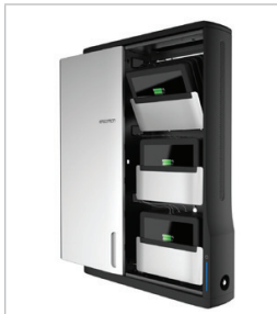
Zip12 Charging Wall Cabinet