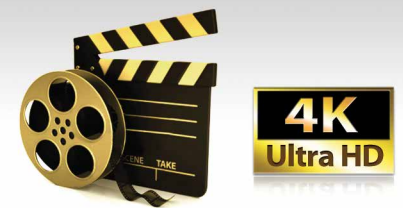
Perfect for 4K & Full HD professional cinematography