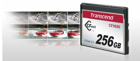
Unprecedented transfer speeds

To meet the high data transfer demands of Ultra High Definition filmmaking, Transcend's CFast 2.0 CFX650 Memory Cards feature unprecedented read and write speeds and boast incredible storage capacities. Designed to support high-end 4K cameras and recorders from the leading manufacturers, CFX650 Memory Cards support the latest CFast 2.0 specifications for extreme performance, best suited for the professional cinematographer shooting high-resolution Full HD and 4K video.