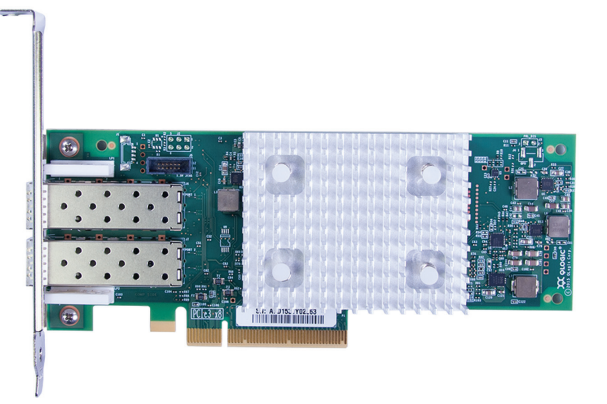
QLogic Gen5 Enhanced FC 16Gb Dual-port HBA