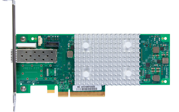
QLogic Gen5 Enhanced FC 16Gb Single-port HBA

Unsurpassed performance, simplified management and superior reliability