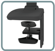
SHOWN WITH WORKFIT-TL SIT-STAND WORKSTATION

INCLUDED: STANDARD 2-PIECE DESK CLAMP ATTACHES TO SURFACE EDGE