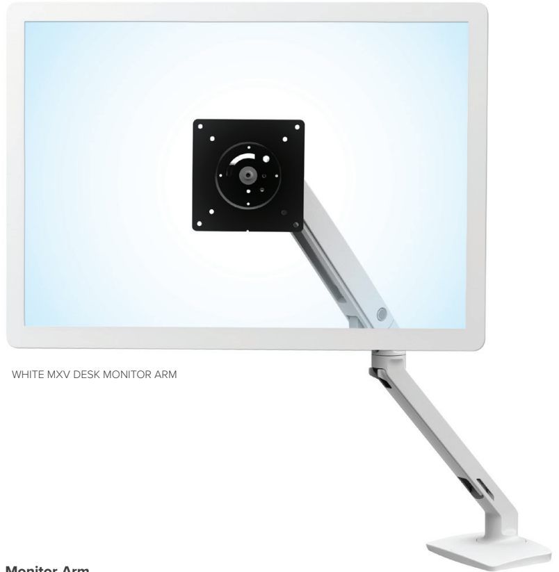
WHITE MXV DESK MONITOR ARM