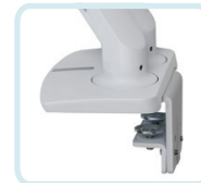
INCLUDED: SHALLOW 2-PIECE DESK CLAMP ATTACHES TO SURFACE EDGE