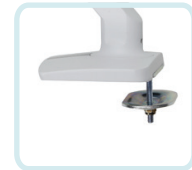
GROMMET MOUNT ACCESSORY (#98-110) ATTACHES THROUGH SURFACE HOLE