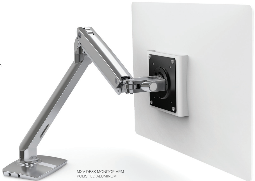
MXV DESK MONITOR ARM POLISHED ALUMINUM

SLEEK PROFILE AND MODERN DESIGN: LIGHTWEIGHT ARM ELEVATES YOUR SPACE WITH FUNCTIONALITY AND STYLE