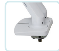
GROMMET MOUNT ACCESSORY (#98-111) ATTACHES THROUGH SURFACE HOLE

Download additional literature at ergotron.com For more information: NORTH AMERICA 800.888.8458 / +1.651.681.7600 / sales@ergotron.com EMEA +31.33.45.45.600 / info.eu@ergotron.com APAC apaccustomerservice@ergotron.com OEM info@oem.ergotron.com