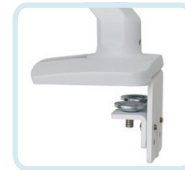
INCLUDED: SHALLOW 2-PIECE DESK CLAMP ATTACHES TO SURFACE EDGE